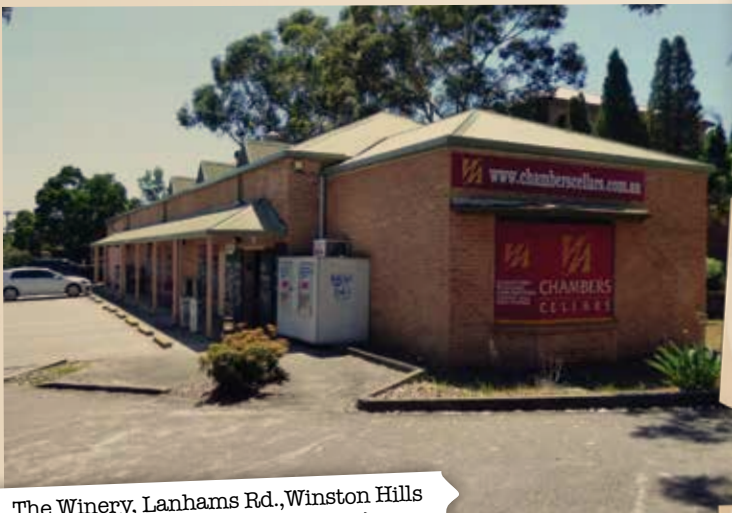
The Winery, Lanhams Rd., Winston Hills in 2016