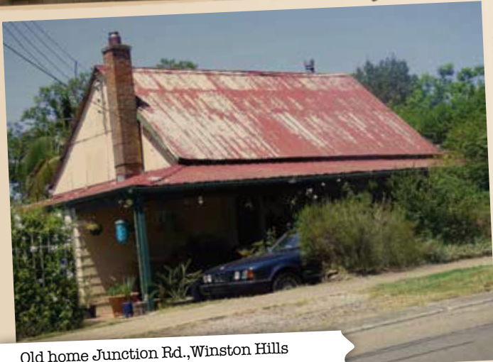
Old home Junction Rd., Winston Hills

COLLECTION COMPILED BY IVOR JONES SHOWING LIFE IN THE HILLS AND HAWKESBURY AREA DURING PAST DECADES.