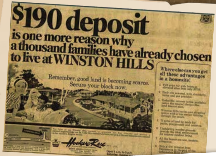
Advertisement in Sydney Morning Herald in 1968