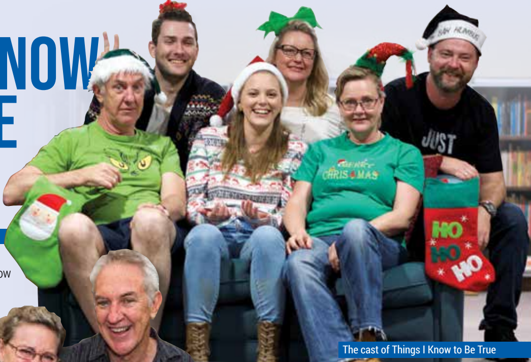
The cast of Things I Know to Be True