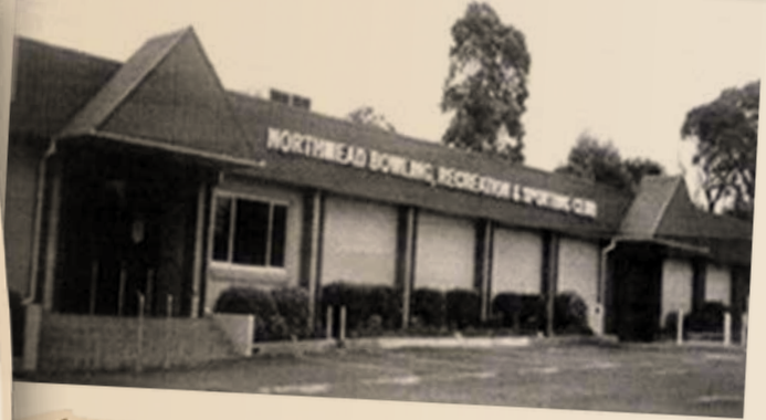
Northmead Bowling Club, Windsor Rd., Northmead.