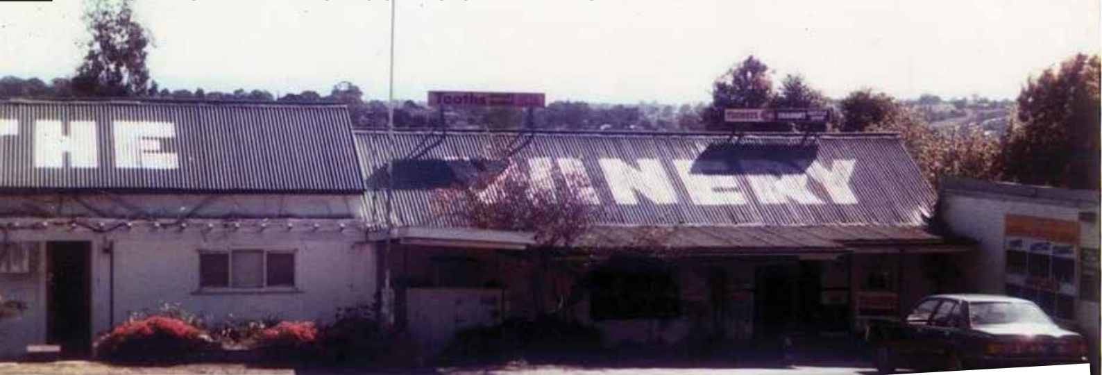
The Winery, Lanhams Rd., Winston Hills