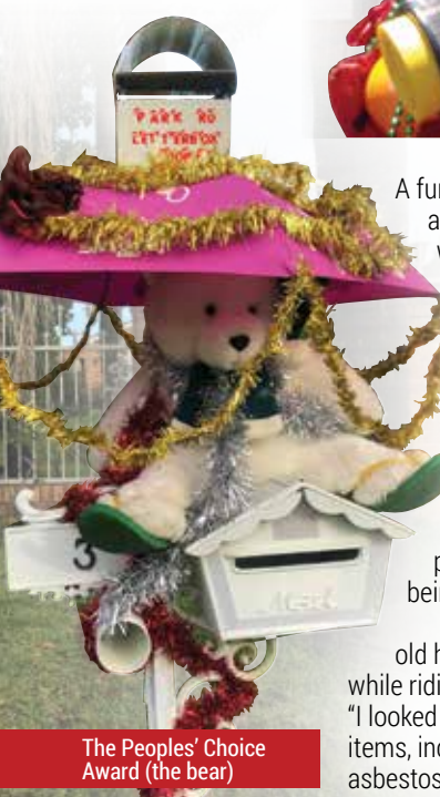
The Peoples' Choice Award (the bear)

The connecting roads of Roughley and Hafey will be involved in the new edition, having been able to vote for the inaugural event.