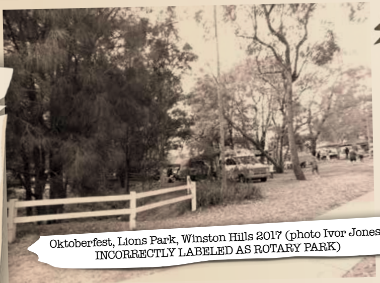
Oktoberfest, Lions Park, Winston Hills 2017 INCORRECTLY LABELED AS ROTARY PARK