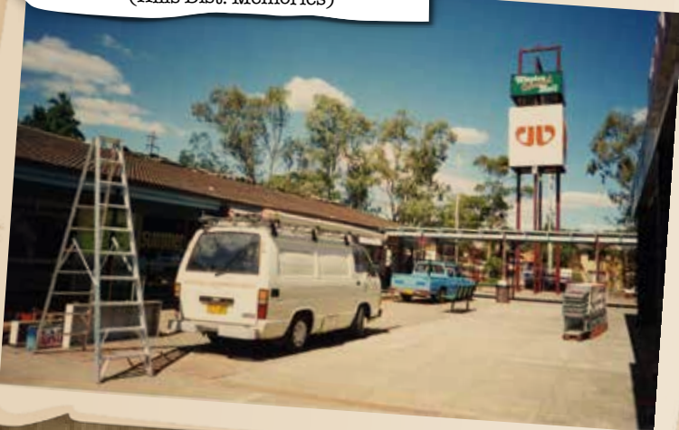
Winston Colonial Mall, Winston Hills